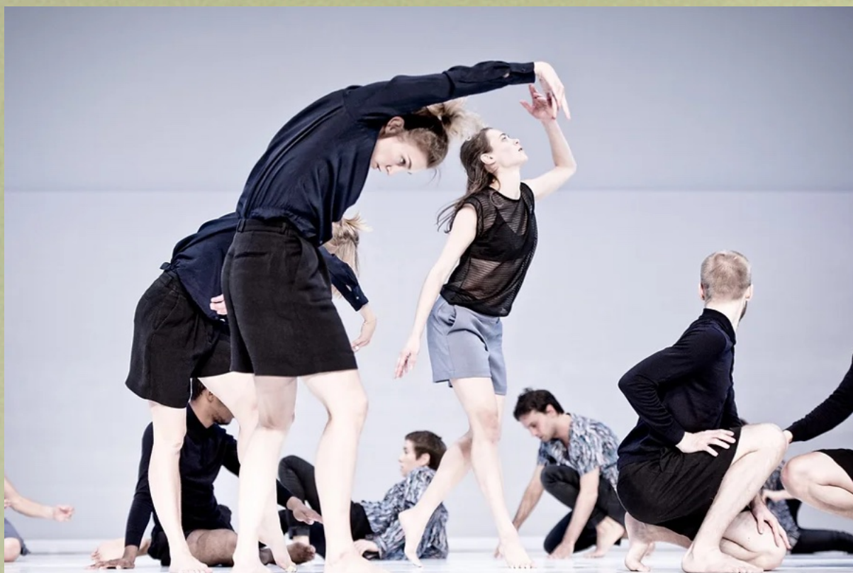
FIGURE A SEA DEBORAH HAY

In Figure a Sea the dancer and the stage become a sea of endless possibilities. The choreography moves between being technically proficient and minimalist in its expression. It is intimately choreographed yet never the same. Hay challenges, without diminishing, the dancer's intelligence, beauty, humor, and alacrity. Ease, accuracy, visibility, ambiguity and uniformity are the work's key ingredients. Deborah Hay proposes the same set of "what if?" questions for the company dancers, as if stacking multiple meditations at once. They do not look at the world when they are dancing. They participate in it.